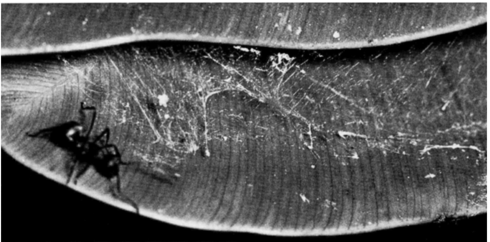
Fig. 3. — Silk wall of the nest of Polyrbachis (Myrmhopta) bicolor Smith 1858 between two leaves of a citrus tree.

covered nests would not be hidden below a large leaf of a palm or ginger plant. Instead they would be conspicuous from above as a dark area shining through the leaves. Also from below such a nest would be also clearly visible. P. muelleri with its ample silk nests, however, has developed strategies against those problems, enabling it to colonize large moderately translucent leaves. No shaded area can be detected