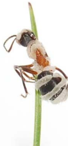
Figure 3. Pandora -infected Formica exsecta worker after the outbreak of the fungi.

Europe. It is known from the territory of the former Czechoslovakia (Balazy 1993), Germany (Balazy 1993), the Netherlands (Boer 2008), Poland (Balazy 1993, Sosnowska et al. 2004), Russia (Marikovsky 1962), Sweden (Balazy 1993), Switzerland (Turian & Wuest 1977, Balazy 1993), and the territory of the former Yugoslavia (Balazy 1993).