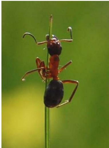
Figure 2. Pandora -infected Formica exsecta worker before the outbreak of the fungi.