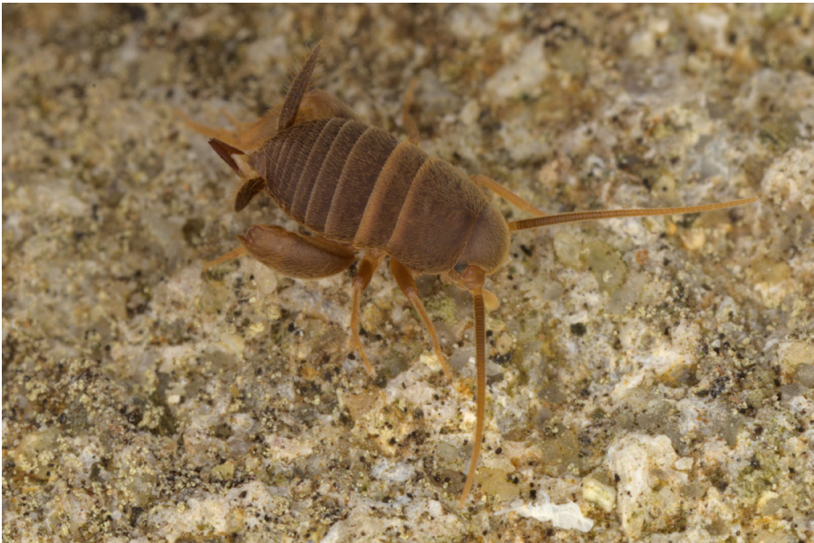
Figure 1: Myrmecophilus fuscus , adult female. 2 November 2019, La Roque-sur-Pernes, France.

the basis of three specimens (1♂ and 2♀♀) (BACCETTI, 1966; SCHEMBRI, 1984). M. baronii was subsequently discovered on Pantelleria, at Lago Bagno dell'Acqua, on 30 March 1990 (BACCETTI et al. , 1995) and later at Bir Bou Rebka and El-Fahs, Zaghuan in Tunisia, between the 10 th and 14 th April, 2010 (STALLING, 2014). In December 1970, LANFRANCO (1970) reported the presence of a " Myrmecophila sp." from a single specimen found by the author's brother, Edwin, in Sliema. It was tentatively determined as M. acervorum (Panzer, [1799]), but the author casts some doubt in view of its similarity to M. ochraceus (referred to as M. ochracea in the original contribution) and further suggests that more specimens ought to be examined before confirming the species' identification, given the damaged condition of the specimen. CILIA (1975) reported the presence of two forms of a 'yet to be determined' species of ant cricket from Buskett (dark brown form) and Comino (pale yellow-brown), among other unnamed sites. SCHEMBRI (1984) reported a second record of M. baronii and subsequently a third, both from Buskett, respectively, 2♀♀ on 30 April 1983 and 1♀ on 30 April 1984. The author adds that M. ochraceus was a seemingly widespread species and provided a map with its recorded distribution across Malta, Gozo and Comino. STALLING (2015) added a new record for the Maltese Islands, that of the recently described Myrmecophilus fuscus Stalling, 2013 (Fig. 1).