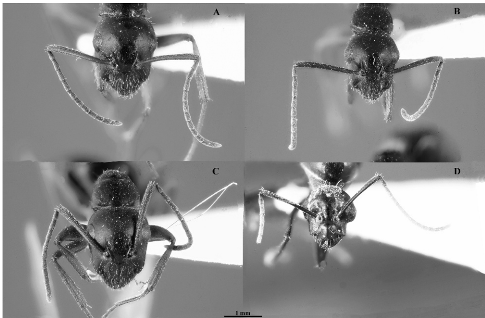
Fig. 2. Camponotus ruseni n. sp. head (in frontal); A- worker major (holotype); B- worker minor; C- worker major (scarce hair); D- male.

with 5 teeth, eyes situated on posterior half of the head, and covered by short hairs; antennae 12-segmented; scape almost as long as head length, surpassing posterior margin of the head by 1/3 of its length, funiculus longer than scape. Alitrunk with slight metanotal groove; dorsum of propodeum transversally concave as in minor workers of C. truncatus ; propodeal declivity almost straight; petiole thin, tapering to the apex seen in profile, basal part of its anterior face straight and upper part slightly convex; dorsal margin of petiole almost “Λ” shaped seen in front.