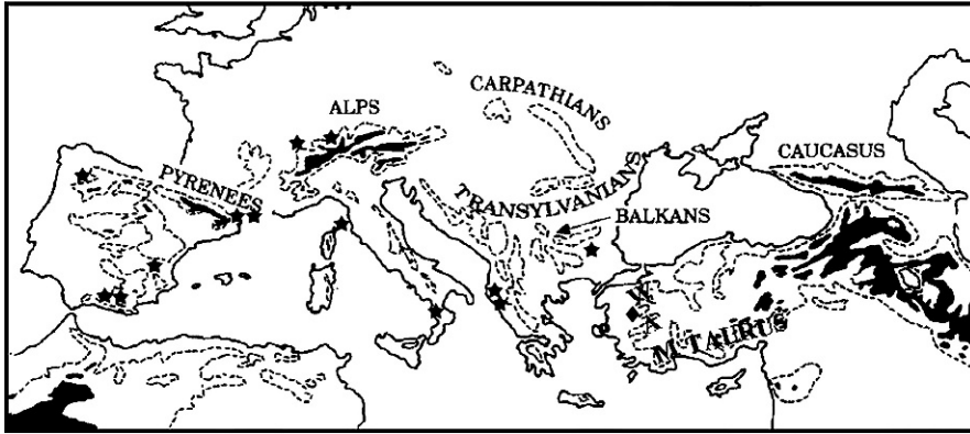
Fig. 4. South European Mountain Belt. ◆: Type locality of C. rusei ; ★: Distribution of C. universitatis . Dotted line = over 1000 m, black regions = over 2000 m altitude. WAM: Western Anatolian Mountains. Based on Hewitt, 1999.

venation, absence of worker caste and pupoid males are missing in C. universitatis (Tinaut et al. , 1992). Despite the absence of some inquiline-like characters, C. universitatis is considered as an inquiline species by Hölldobler and Wilson (1990) and Buschinger (2009).