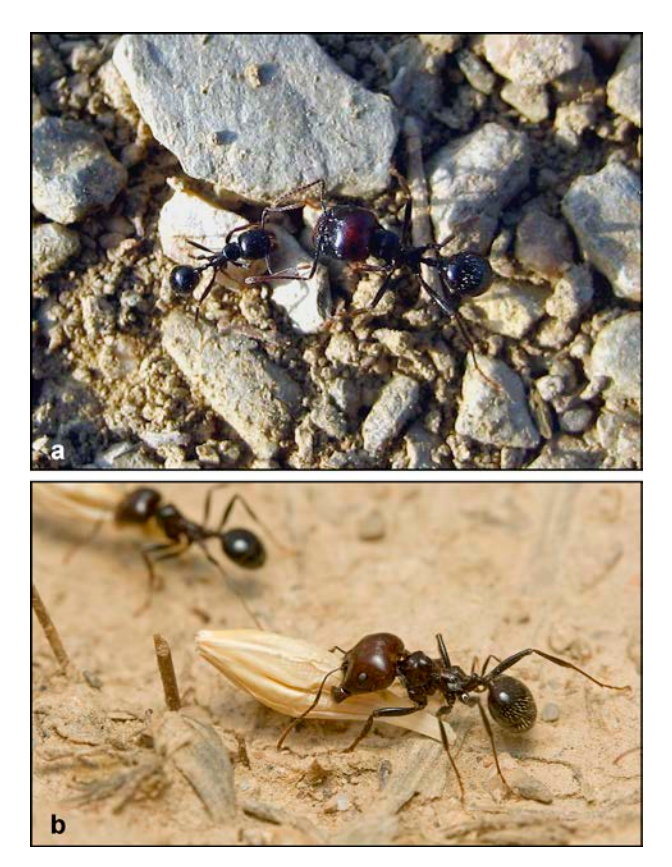
Fig. 2: Old World Messor : a) A major worker of M. barbarus carries a seed of Planatus hybrida in Sevilla, Spain. b) A laden M. structor forager.

Messor barbarus is the best studied group foraging species. It is a polymorphic species that has temporary and permanent components to its trails (PICKLES 1944) (Fig. 2a). The description of permanent foraging trails having "vegetation and other obstacles found by workers... cleared" (DETRAIN & al. 2000) fits our definition of trunk trails. Trail length ranges from 1 - 30 m (REYES 1986, CERDAN 1989, DETRAIN & al. 2000). Claire Detrain (pers. comm.) describes trails as about 10 - 20 cm wide, and they are often branched (LÓPEZ & al. 1993a, 1993b, 1994). More branching and shorter links develop after a productive season, whereas an unproductive season results in longer links and fewer branches (LÓPEZ & al. 1994). This change in topology adjusts the search area to the resource level.