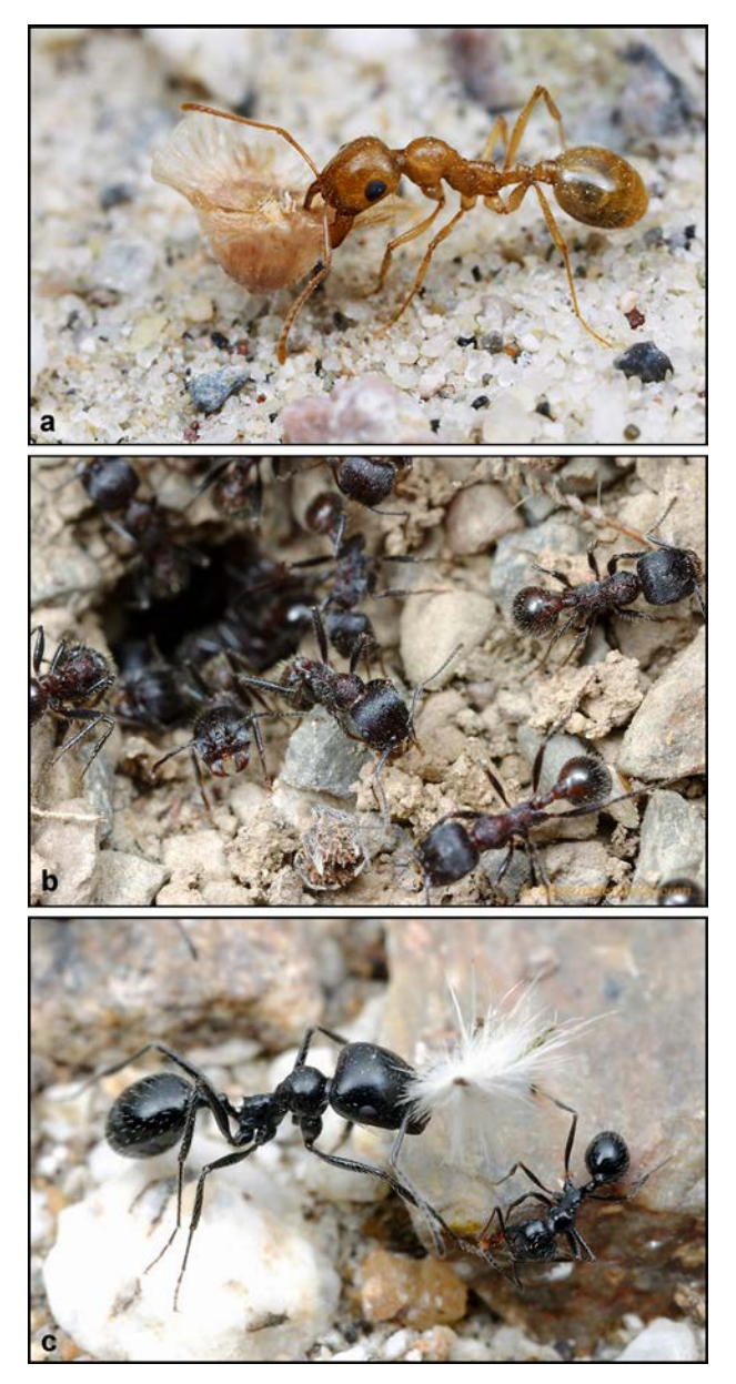
Fig. 3: New World Messor : a) Nocturnal species of Messor are pale in color, like this M. lariversi forager. b) Monomorphic M. andrei exiting a nest entrance, California, USA. c) Polymorphic M. pergandei workers carrying seed along a trail.

among these three species suggest that group foraging has evolved at least twice in New World Messor (BENNETT 2000, JOHNSON 2001).