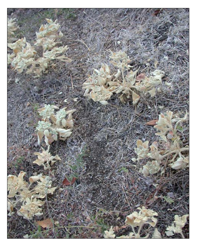
Fig. 1: Trunk trail (runs vertically through photograph) cleared by a Nearctic Messor , M. andrei , California, USA.

Group recruitment is when a leader ant uses motor displays to induce 5 - 30 workers to follow a short-lived odor trail, such as occurs in several Camponotus species (HÖLL DOBLER 1971a), Aphaenogaster cockerelli , A. albisetosus (HÖLLDOBLER & al. 1978), A. senilis (CERDÁ & al. 2009),