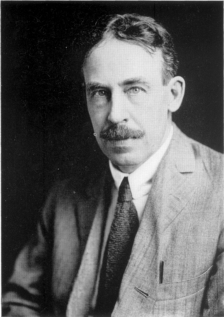
WILLIAM MORTON WHEELER