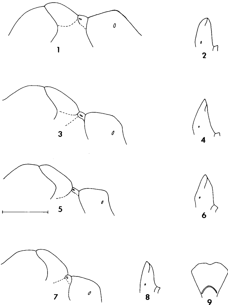
Fig. 1-9. Worker thoracic and petiolar profiles, respectively, of (1-2) Formica subintegra ; (3-4) F. rubicunda ; (5-6) F. pergandei ; (7-8) F. gynocrates ; (9) scale of petiole, anterior view, F. gynocrates . Scale line = 1.0 mm.

The following key will separate the presently described members of the sanguinea group in North America, including the new species described below. It replaces the earlier key by Buren (1968), which has proven to be unsatisfactory. Specimens from Colorado, Montana, Nebraska, and Wyoming may present difficulties since undescribed species are present in those States.