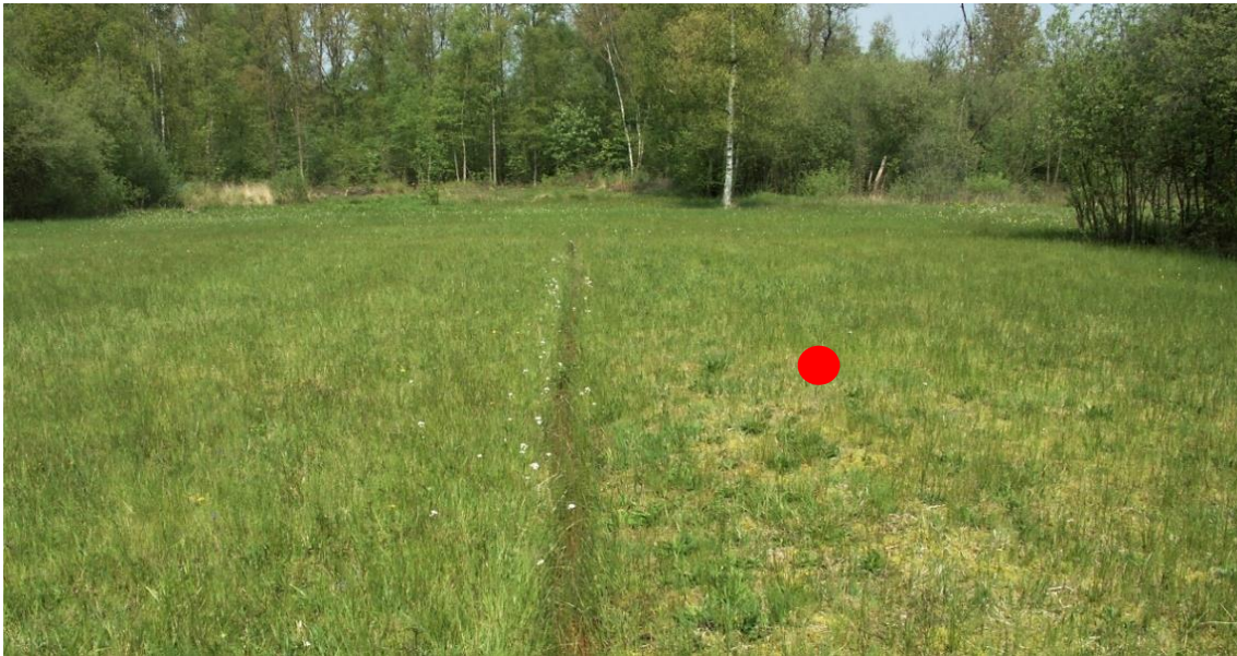
Fig. 1. Molinia grassland in early spring where M. karavajevi was found at nature reserve Vorsdonkbos-Turfputten (Aarschot, Belgium). Pitfall trap VOTU1 (indicated by a red circle) was placed a few meters to the right of the central ditch.

grassland and transition mire. On both locations, two glass jars were dug in the soil and filled for two thirds with a 4% formaldehyde solution. Water surface tension was broken with a few drops of detergent. A small cage consisting of an iron grate and a plexiglass cover was placed over the trap for protection and to avoid catching small vertebrates. The traps were installed on 30-03-2018 and removed on 27-10-2018. They were emptied more or less every 3 weeks. The pitfalls were both placed near an existing piëzometer, VOTP001B and VOTP020A respectively ( www.watina.inbo.be ). In addition, a vegetation survey was made at each location in a 4×2 m plot using the semi-quantitative Londo scale (LONDO, 1976). The most dominant plants in the VOTU1 vegetation survey plot were Succisa pratensis Moench (1794) and Equisetum palustre L. (1753), followed by Juncus articulatus L. (1753), Potentilla erecta (L.) Raeusch. (1797) and Luzula multiflora (Retz.) Lej. (1811).