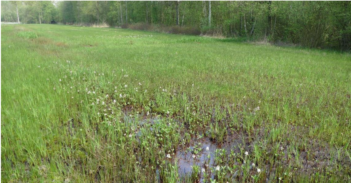
Fig. 2. Transition mire with flowering Menyanthes trifoliata in early spring where M. karavajevi was found, nature reserve Vorsdonkbos-Turfputten (Aarschot, Belgium). The exact location is left of the picture at a slightly elevated site near a solitary oak tree.