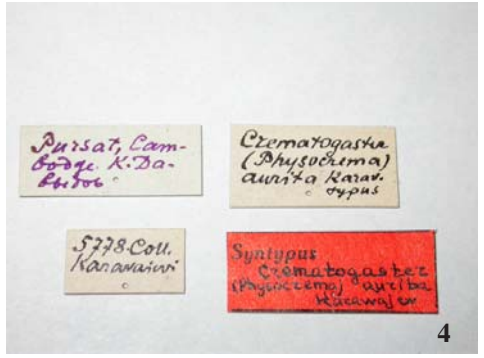
Figs 1-4. Lectotype of Crematogaster (Physocrema) aurita Karawajew: 1, full face view; 2, dorsal view; 3, lateral view; 4, labels attached.