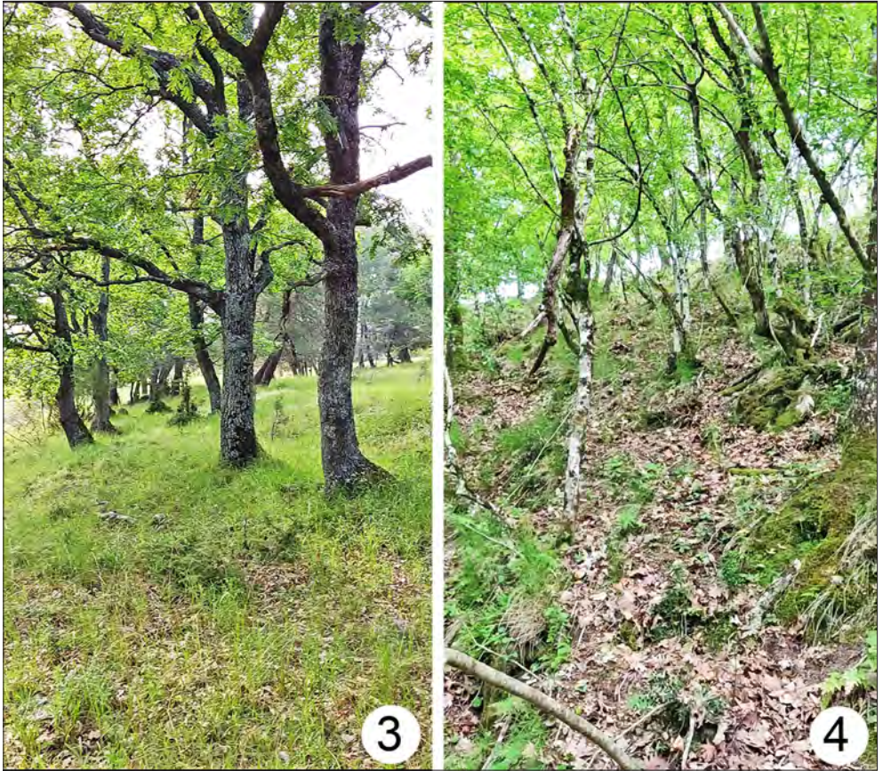
Figs. 3–4. Habitat where ants new to Greece were found. Camponotus tergestinus MÜLLER (3); Lasius sabularum (BONDROIT) (4).