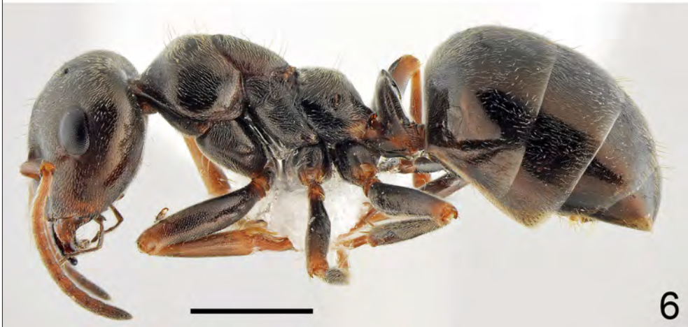
Figs. 5–6. Habitus and head: Proformica korbi (EMERY): minor worker lateral (5), major worker lateral (6) (scale bar = 1 mm).