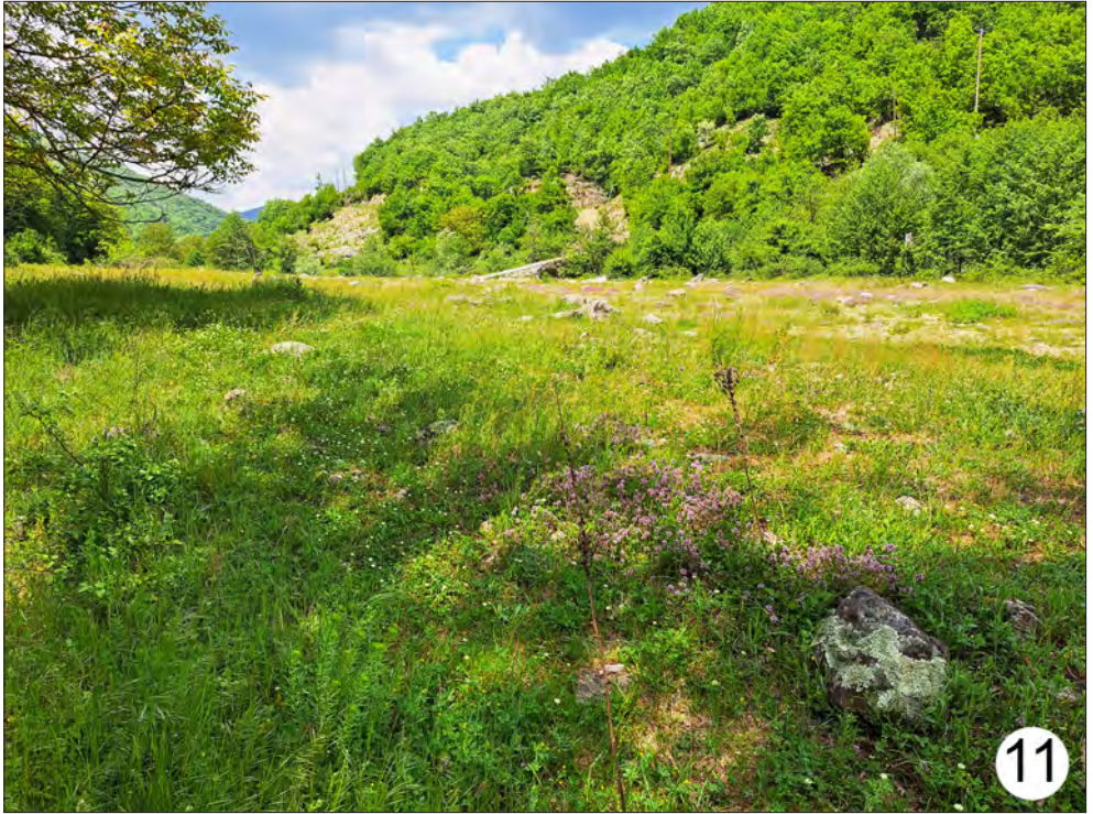
Fig. 11. Grassland habitat of Strongylognathus karawajewi PISARSKI.

Accepted: 27 October 2023; published: 10 November 2023