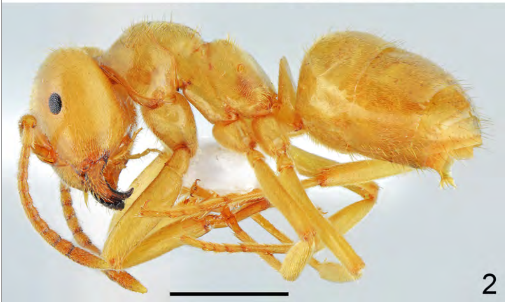
Figs. 1–2. Habitus lateral: Camponotus tergestinus MÜLLER, gyne (1, scale bar = 2 mm); Lasius sabularum (BONDROIT), worker (2, scale bar = 1 mm).