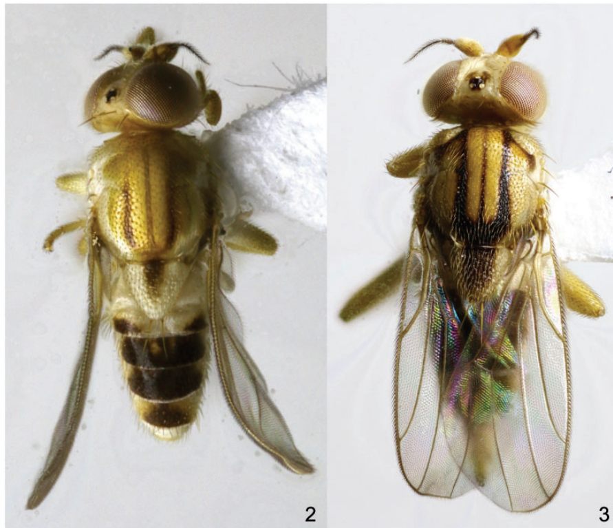
Figs. 2–3. P. paratolmos , dorsal view. 2. Male. 3. Female.

Thorax with pronotum distinct in dorsal view, pale yellow; postpronotum, notopleuron, and lateral margin of scutum pale yellow, scutum darker yellow medial to intraalar region, with medium brown stripe along dorsocentral line from just anterior to suture to posterior margin, lines curved medially anterior to scutellum; scutal setae pale, postpronotal and notopleural setae slightly darker; one anterior and two posterior notopleural setae; row of prescutellar