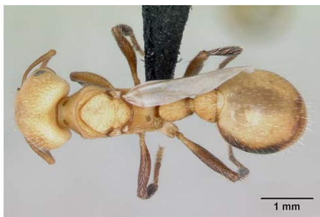
Fig. 3 Photograph of Pogonomyrmex huachucanus Wheeler brachypterous callow queen in dorsal view. The forewing (which has already fallen off) extends approximately the same length as the hindwing. For comparison, the wings of fully winged volant congeners extend beyond the tip of the gaster

polygynous, or that they could subsequently leave with a group of workers to form a new colony (DCF). Thus far, no nests have been found in any of these three species that would suggest DCF, i.e., with a queen, few workers, and no brood.