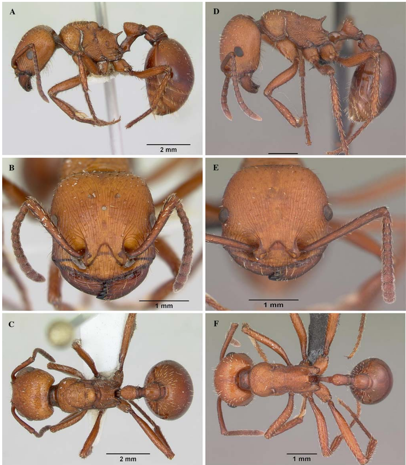
Fig. 2 Photograph of Pogonomyrmex cunicularius cunicularius Mayr ergatoid queen and worker: a lateral view of ergatoid queen body, b frontal view of ergatoid queen head, c dorsal view of ergatoid

queen body, d lateral view of worker body, e frontal view of worker head, and f dorsal view of worker body