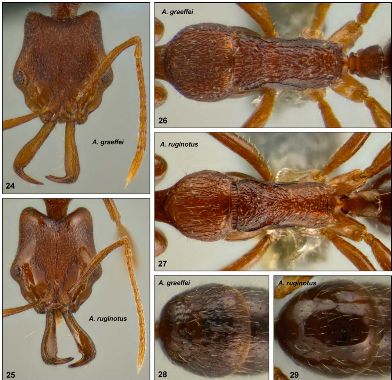
Figs. 24 - 29: Comparison of (24, 26, 28) Anochetus graeffei (Luzon, Mt. Banahaw; NHMW; TL 3.61 mm, HW 0.79 mm) and (25, 27, 29) A. ruginotus (Surigao, Songkoy Spring; NHMW; TL 4.43 mm, HW 1.03 mm). (24, 25) Head, frontal aspect; (26, 27) mesosoma and petiole, dorsal aspect. (28, 29) gaster, dorsal aspect.

sent in the Philippines (see above). At a first glance A. ruginotus and A. graeffei have a very different habitus. While in A. graeffei the head is squared and the mesosoma is broad, A. ruginotus has a deep emargination of the vertex and the mesosoma is slender as in most other Anochetus species (comp. Figs. 24 - 27). Body size, ratio of PW / HW and sculpture of gaster tergite 1 (see the key above and Figs. 28 - 29) differ conspicuously when comparing Philippine specimens of the two taxa. However body size ranges are overlapping when including all populations of A. graeffei s.l. The entire mandible, but most notably its apical teeth are usually more gracile in A. graeffei than in A. ruginotus (comp. Figs. 3 and 4), except for the syntypes of A. rudis , which have stout mandibles, almost as A. ruginotus . An additional difference between A. ruginotus and A. graeffei is found in head sculpture (comp. Fig. 24 and 25). Al-