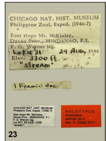
Figs. 20 - 23: Anochetus wernerii sp.n., holotype worker (FMNH; TL 9.40 mm, HW 1.83 mm, PnW 1.09 mm). (20) Head, frontal aspect; (21) habitus, lateral aspect; (22) mesosoma and petiole, dorsal aspect; (23) labels.

terior aspect (Fig. 22); peduncle short. Gaster tergite 1 with sparse, fine punctures. Whole dorsum with sparsely distributed, erect setae; setae on legs comparatively long.