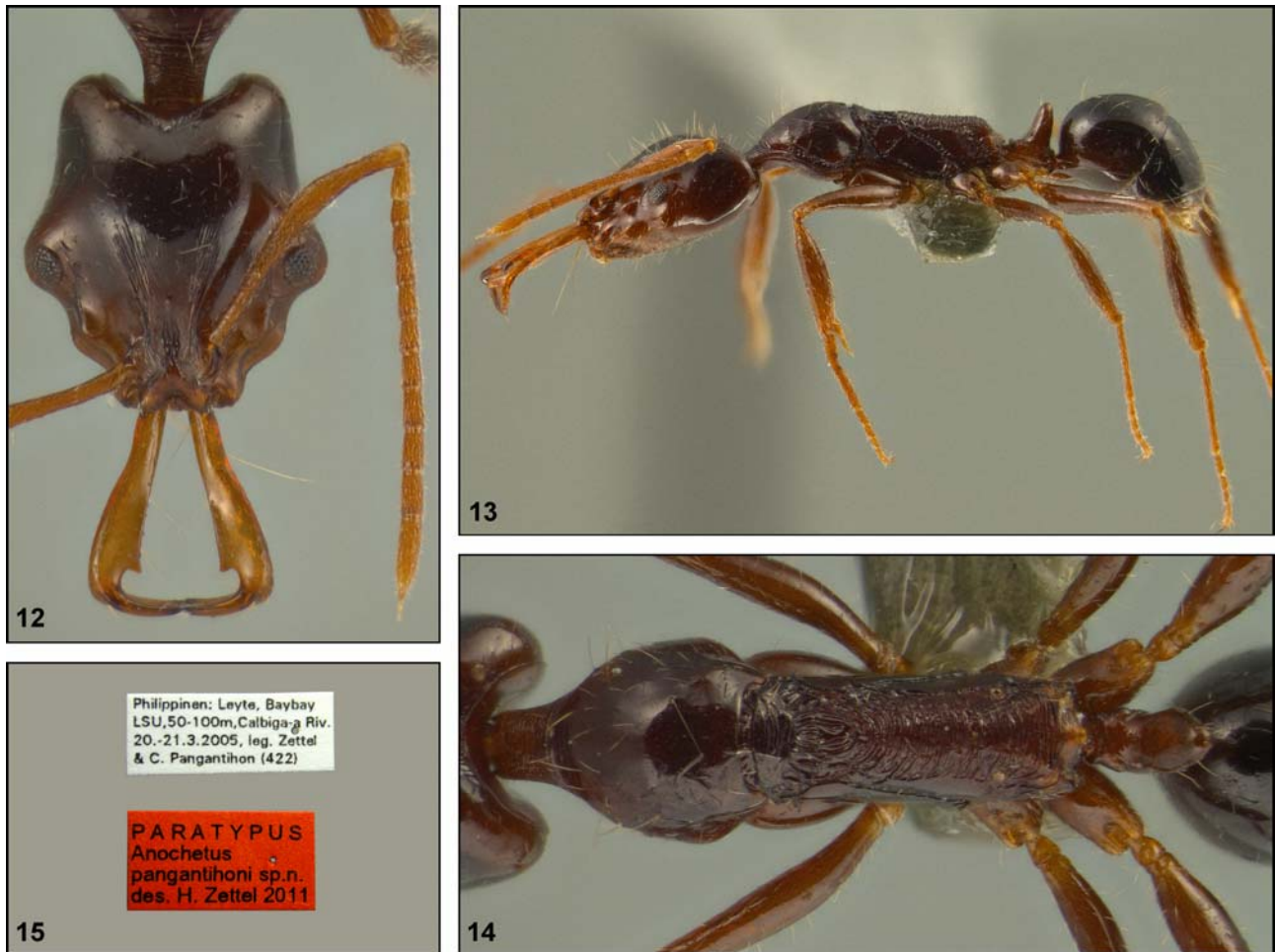
Figs. 12 - 15: Anochetus pangantihoni sp.n., paratype worker (CZW; TL 4.89 mm, HW 1.07 mm). (12) Head, frontal aspect; (13) habitus, lateral aspect; (14) mesosoma and petiole, dorsal aspect; (15) labels.

pangantihoni sp.n., obsolete in A. brevis , and filling the entire frontal area and slightly surpassing the frontal carinae posteriorly in A. modicus .