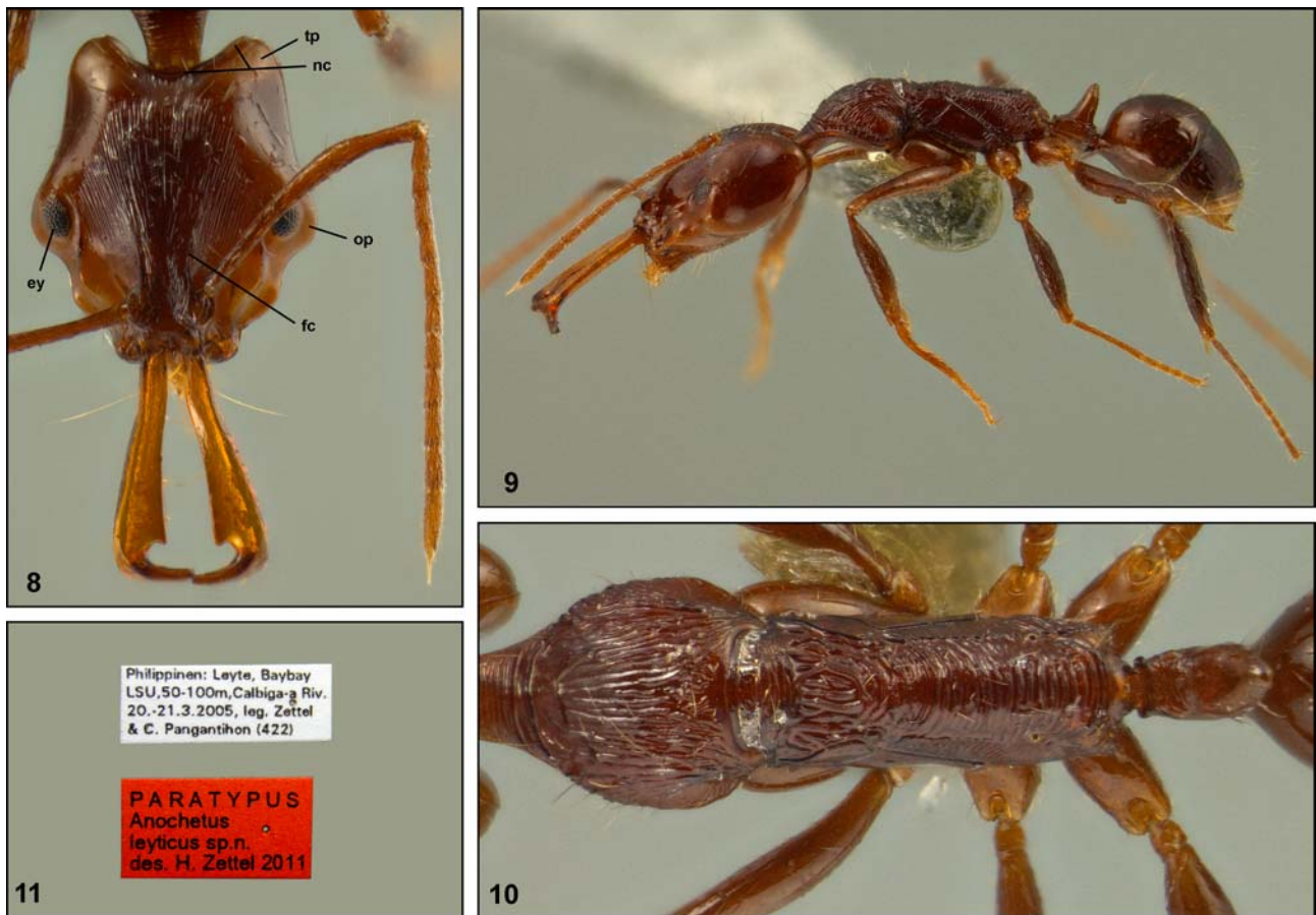
Figs. 8 - 11: Anochetus leyticus sp.n., paratype worker (CZW; TL 5.63 mm, HW 1.22 mm). (8) Head, frontal aspect; ey = compound eye, fc = frontal carina; nc = nuchal carina, op = ocular prominence; tp = temporal prominence; (9) habitus, lateral aspect; (10) mesosoma and petiole, dorsal aspect; (11) labels.

PtW 0.20. Measurements of paratype with largest HW: TL 4.84; HL 1.19; HW 1.10; CI 92; MdL 0.79; MdI 66; SL 1.01; SI 92; MsL 1.64; PnW 0.64; PtH 0.43; PtL 0.46; PtW 0.21.