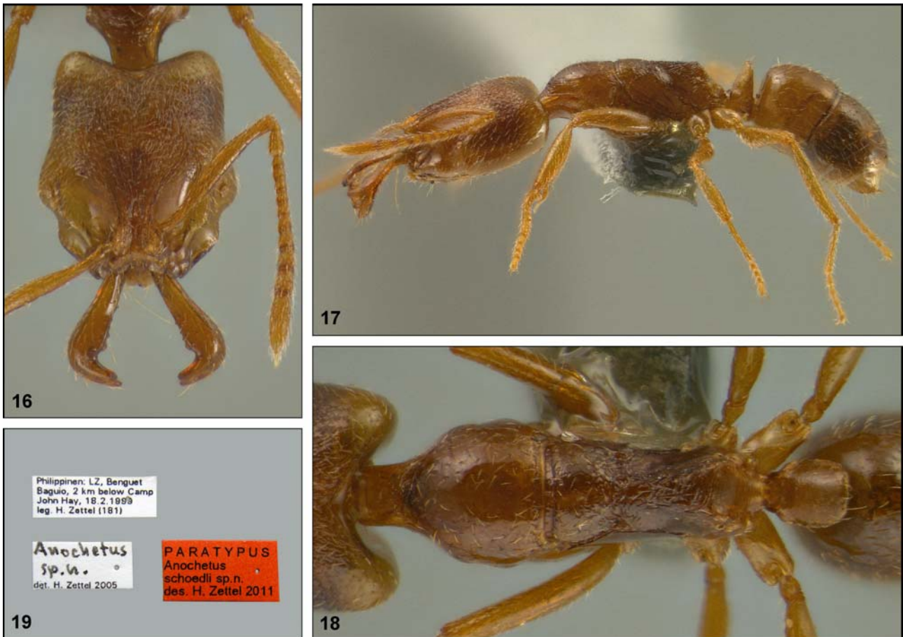
Figs. 16 - 19: Anochetus schoedli sp.n., paratype worker (CZW; TL 3.77 mm, HW 0.84 mm). (16) Head, frontal aspect; (17) habitus, lateral aspect; (18) mesosoma and petiole, dorsal aspect; (19) labels.

longer than combined length of antennomeres 3+4, following antennomeres steadily increasing in length and width; antennomere 12 (including terminal spine) as long as combined length of antennomeres 9 - 11.