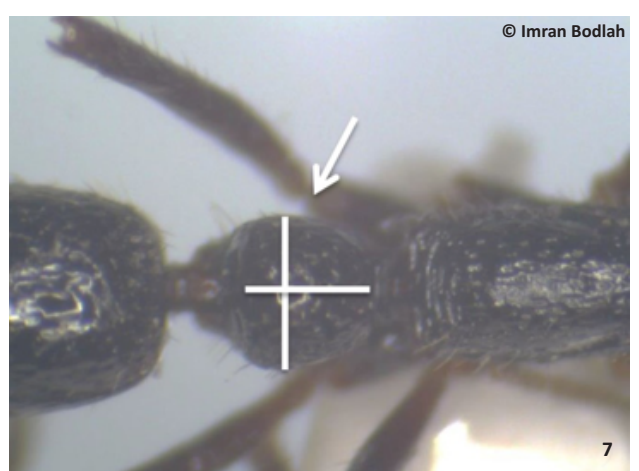
Images 4–7. Leptogenys hysterica Forel, 1900, worker. 4 - distinct metanotal groove; 5 - mesosoma in dorsal view densely punctate; 6 - metathorax rugose laterally; 7 - petiolar node broader than long dorsally