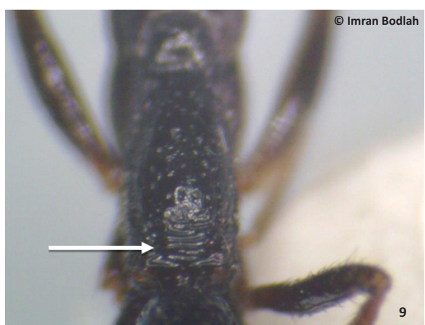
Images 8–9. Leptogenys hysterica Forel, 1900, worker. 8 - gaster length is one half than mesosomal length; 9 - propodeum declivity transversely striated

Burma. Hymenoptera: Ants and Cuckoo Wasps, Vol. II. Taylor and Francis, London, 506pp.