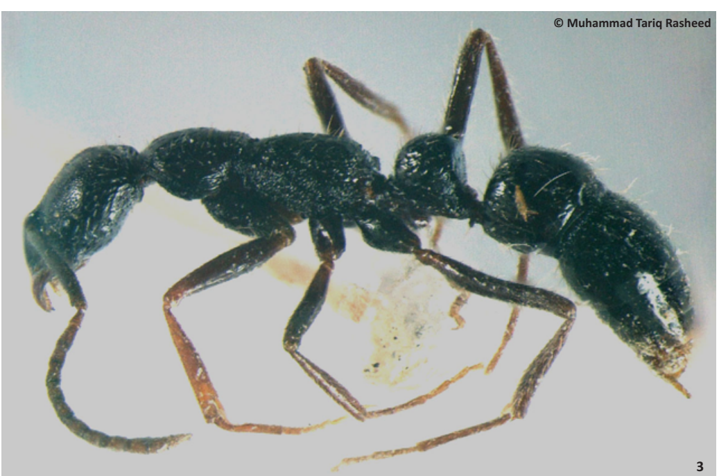
Images 1–3. Leptogenys hysterica Forel, 1900, worker. 1 - head, full-face view; 2 - body, dorsal view; 3 - body, lateral view

near leaf litter and dried vegetation in the forest areas of Margalla Hills in Rawalpindi.