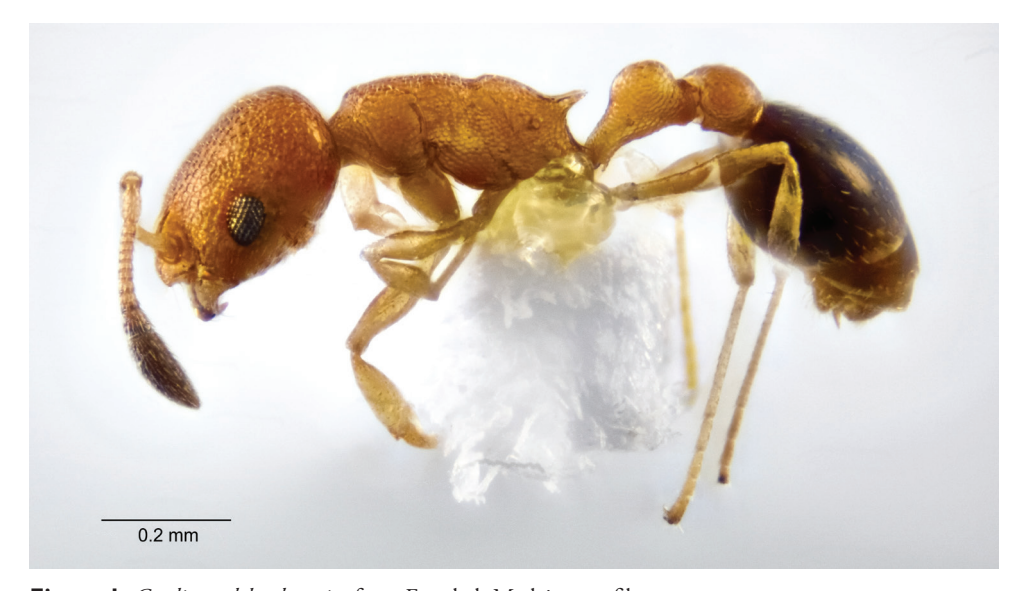
Figure 1. Cardiocondyla obscurior from Funchal, Madeira, profile.

In Europe, this species has been recorded from Germany (Seifert 2003), the Netherlands (Boer et al. 2018) and France (Blatrix et al. 2018), where it is an