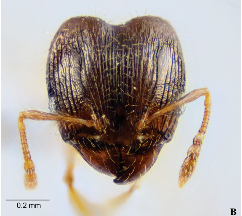
Figure 3. Pheidole navigans from Funchal, Madeira A major worker, profile B major worker, head C minor worker, profile D alate queen, profile.