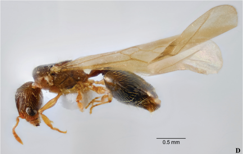
Figure 3. Continued.