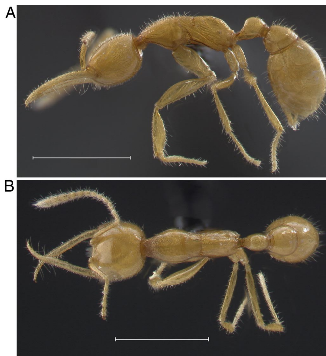
Fig. 1. Holotype worker of Martialis heureka gen. et sp. nov. The single specimen has been collected in the leaf litter of a terra firme rainforest near Manaus, Amazonas, Brazil. Martialis heureka is inferred to be the sister lineage to all extant ants. (A) Lateral and (B) dorsal view of the worker. (Scale bar: 1 mm.)

Here we describe a new ant species, Martialis heureka (Figs. 1 and 2), comprising a new subfamily, the Martialinae, and discuss the implications of this discovery for the early evolution of ants. Morphological results confirm that M. heureka is clearly a member of the family Formicidae because of the presence of the metapleural gland orifice, geniculate antennae, and a morphologically differentiated petiole (Figs. 1 and 2). However, it cannot be placed within any extant or extinct subfamily (20–22, 24). M. heureka is close to, but not within, the subfamily Leptanillinae, because it exhibits several autapomorphies (see diagnosis below) and retains the plesiomorphic condition for other mor-