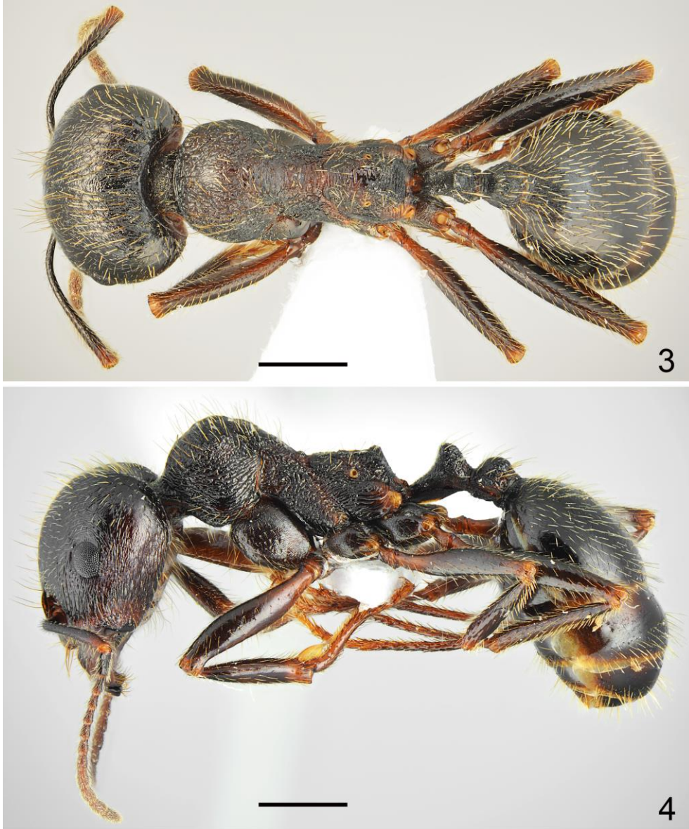
Figs 3, 4. Messor platyceras CRAWLEY, 1920: 3. Major worker dorsal, 4. Major worker lateral (scale bar = 1 mm).