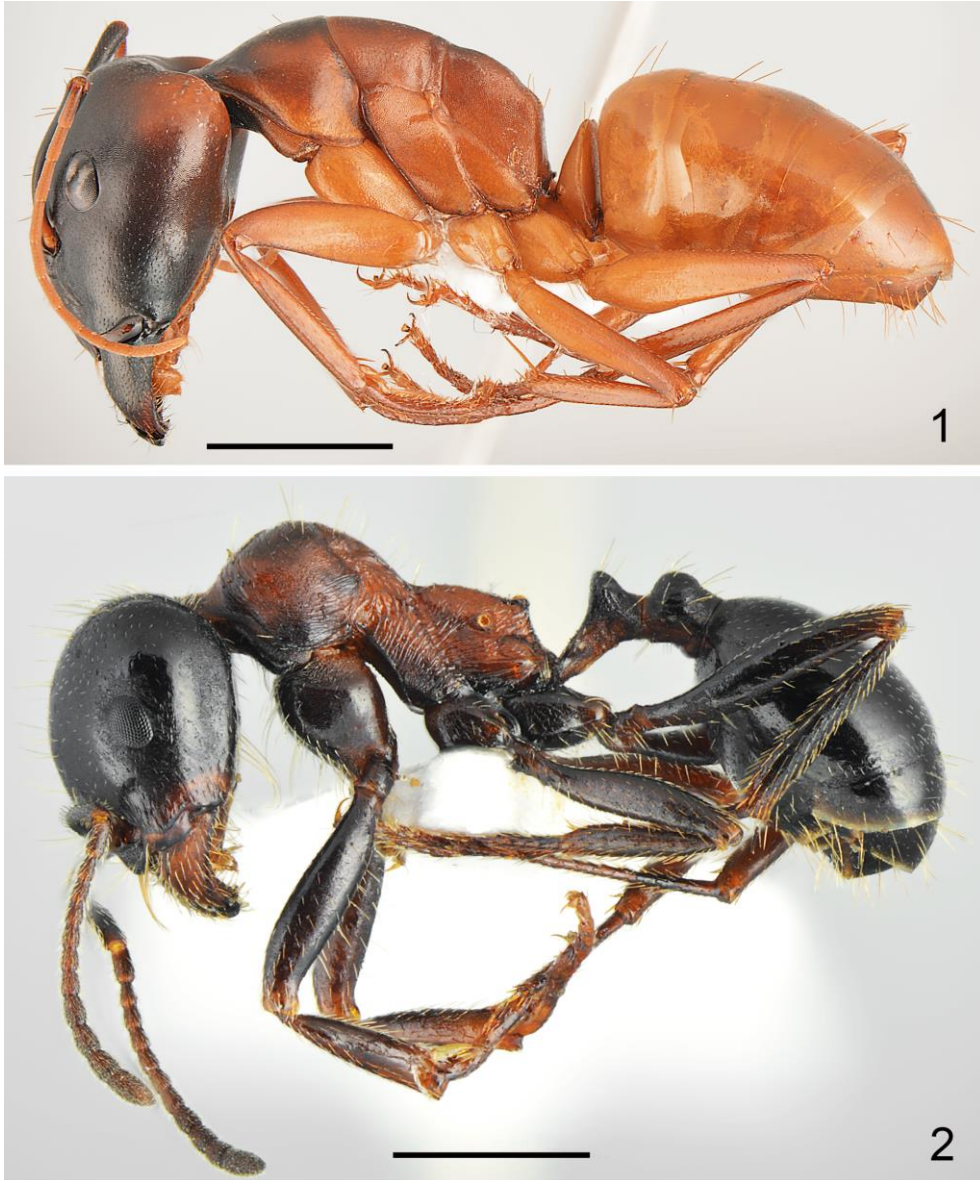
Figs 1, 2. 1. Camponotus oasium ninivae PISARSKI, 1971, major worker lateral (scale bar = 2 mm); 2. Messor mediosanguineus DONISTHORPE, 1946, major worker lateral (scale bar = 1 mm).

in the softer sculpture. Thus the surface of the head in both major and minor workers